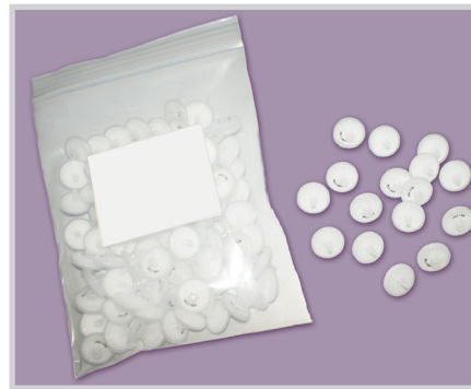
Non-sterile product is polybagged.